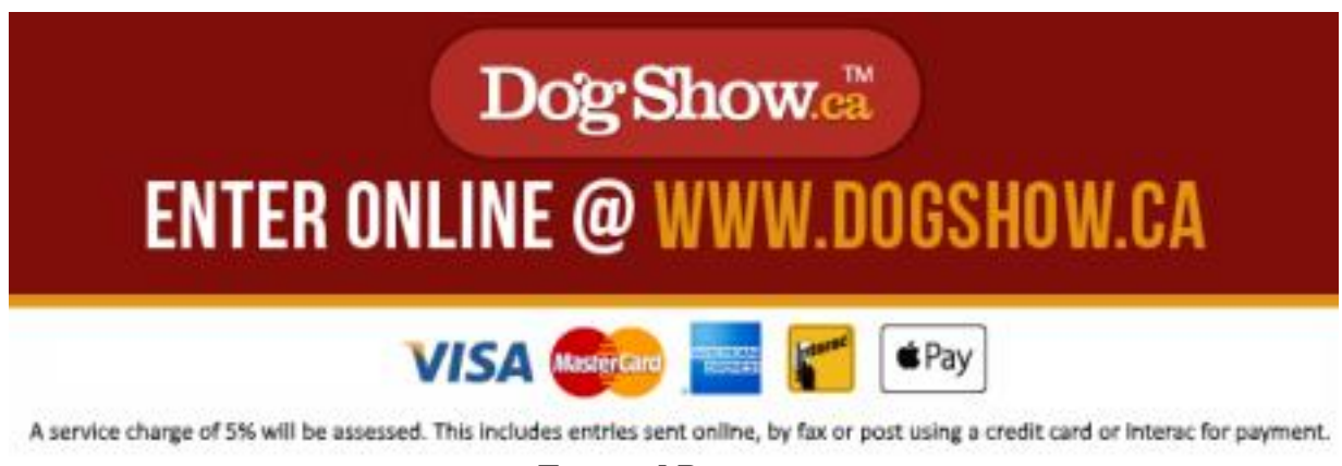
Fees and Payment

Event Fees (including G.S.T.) per Entry Junior = $45.00 Senior = $50.00 Master = $55.00 CKC TCN fee per dog/event = $11.50